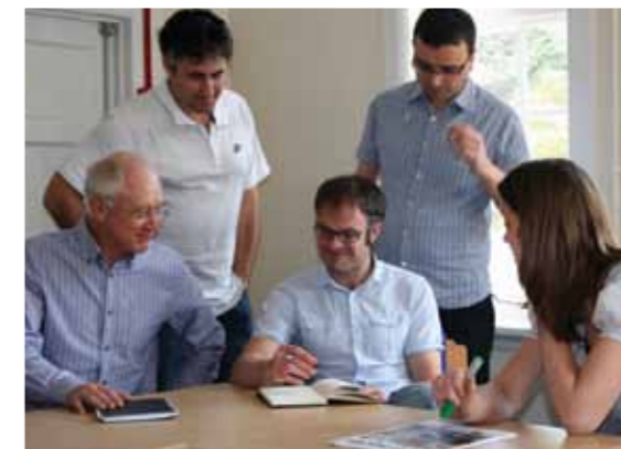
Right image: TSRC team at Birmingham