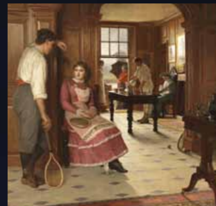
Edith Hayllar – Summer Shower (1883)