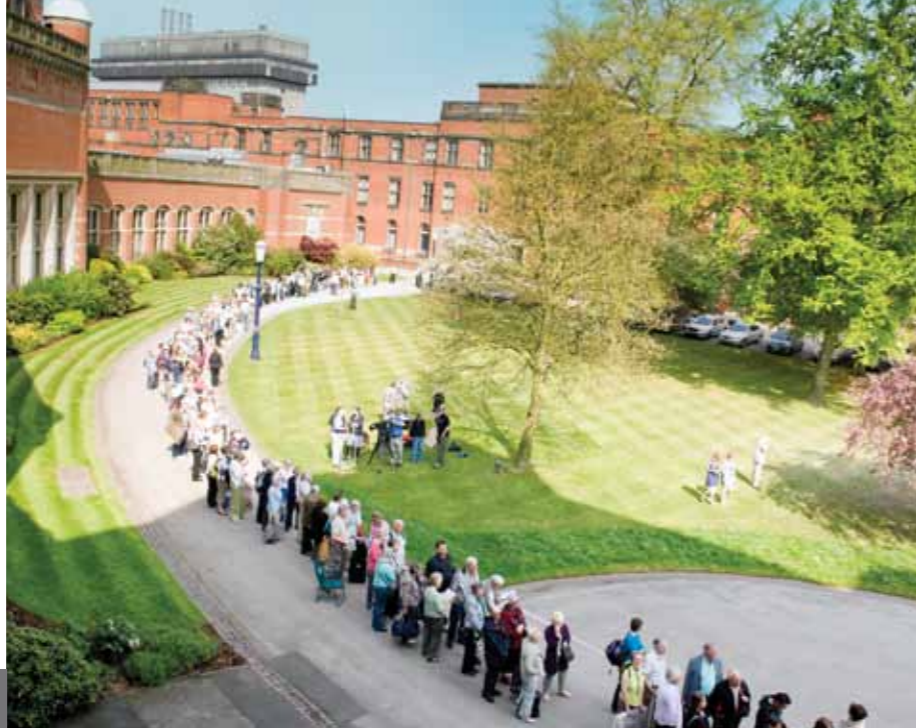
Antiques Roadshow visitors queuing in Chancellor's Court and filming in the Great Hall