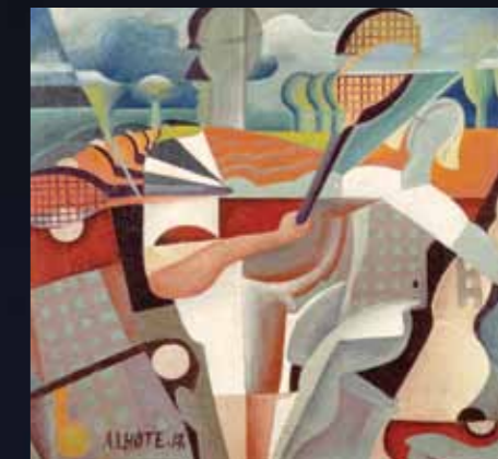
André L'Hôte – Joueurs de Tennis/Tennis Players (1917)

The Barber's forthcoming exhibition Court on Canvas: Tennis in Art was launched onto an international stage recently, with a little help from the mystery woman behind the iconic 1970s poster, Tennis Girl .