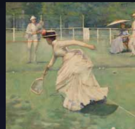
Sir John Lavery – A Rally (1885)