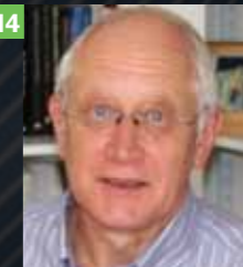
Third Sector Research