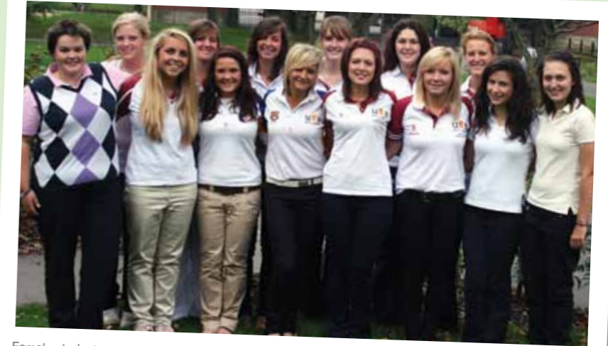
Female students on the Applied Golf Management Studies Degree programme

Typically, golf is seen as a male-dominated sport, however the School of Education is very proud to be bucking this trend with students on the Applied Golf Management Studies Degree programme, delivered in partnership with the Professional Golfers' Association (PGA).