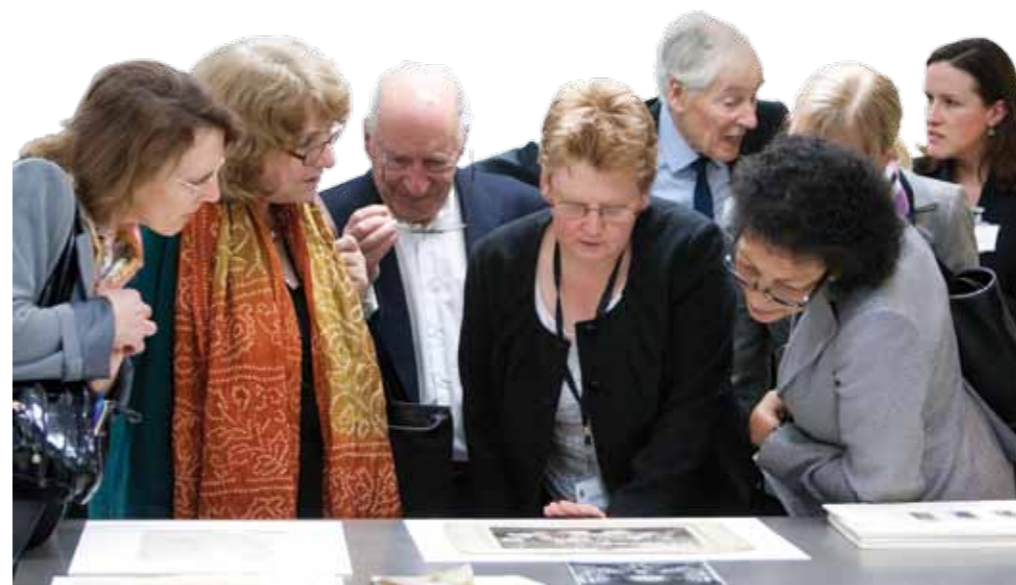
Guests enjoying the collections

The official opening of the new Cadbury Research Library was marked on Thursday 31 March with an evening reception in the foyer of the Muirhead Tower. The event was an opportunity to thank all the benefactors whose generosity had made the new facility possible and the staff whose hard work had brought the collections together in their new home.